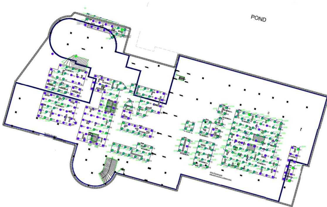
Tower 2 & 3